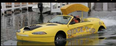
Hydra Spyder Fast Amphibious