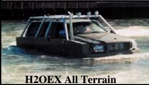
H2OEX All Terrain

M A N U F A C T U R E R S I N T E R N A T I O N A L