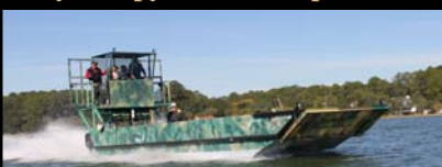
Landing Craft - Non Amphibious

CAMI is celebrating 14 years in business; manufacturing amphibious and non-amphibious vehicles since 1999.