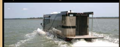
Terra Wind Amphibious Motorcoach