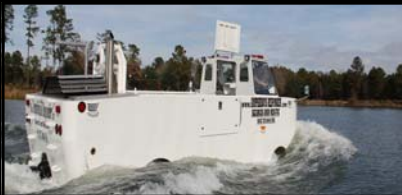
Amphibious Responder Emergency

Unsinkable amphibious vessels due to USCG Approved Flotation Foam, included in CAMI's Patent