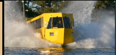
Hydra-Terra Amphibious Tour Bus