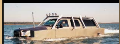
H2OEX 4X4 All Terrain Amphibious

CAMI (843) 717-2444 (Phone) (843) 717-2424 (Fax) Patents & Patents Pending